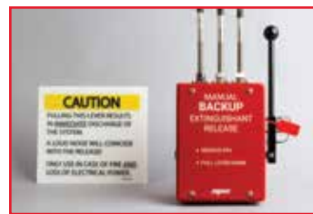
Manual Backup Shown with 3 Cables and Signage