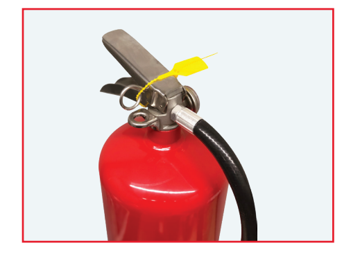
WALL HOOK RING Standard with 5.5, 10, and 20 lb models.