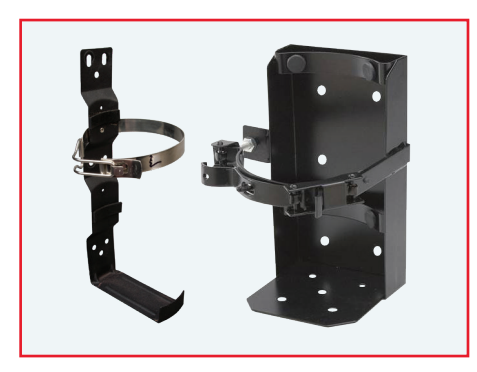
MARINE / VEHICLE BRACKET

Standard with 10 and 20 lb models. Also included with 5.5 lb (WH) model.