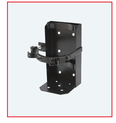
MARINE / VEHICLE BRACKET FOR 11 LB MODEL

Halotron clean agent BC rated extinguishers are available in 5 and 11 lb models. An OPTIONAL heavyduty marine / vehicle bracket is available.